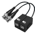
PFM800-E Passive HDCVI Balun